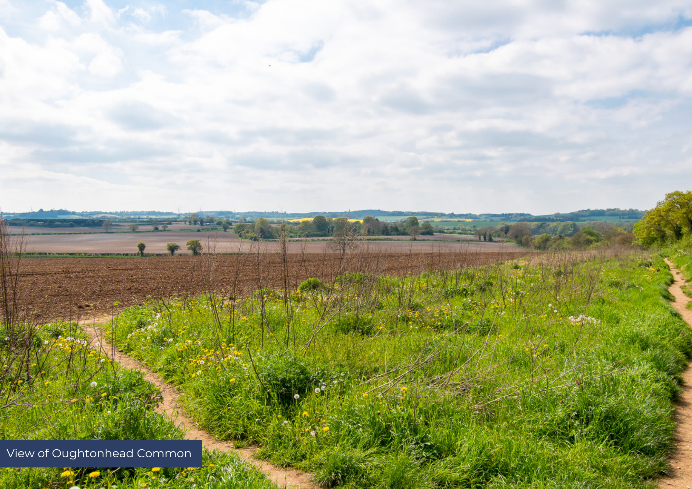
View of Oughtonhead Common